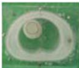
Figure 1. Transverse section of the heart and chest phantom composed of four cylinders, 15 cm long, which represent soft tissue of body contour, lungs, heart wall, and internal blood of the heart.

In this program a non-corrected tomogram of the predefined slice of the phantom was calculated f^0 , using first iteration of MLEM algorithm and zero attenuation map \mu^0 = 0 , (8) . Base on this image data and its sinogram g_i , values of q_{i,j} and \tau_j were calculated to be used with system matrix a_{i,j} for estimation of attenuation map for next iteration \mu^{k+1} through optimization of \sum_{l=1}^m C_l^{p,q} \mu_l = \sum_{i=1}^n \sum_{j=1}^m \left( q_{ij} - \tau_j a_{ij} e^{-s_p \frac{1}{w_q}} \right) \sum_{k \in k_{ij}} r_{ik} \mu_k with constrains used in problem 5. The attenuation corrected emission SPECT image of the next iteration can then be calculated from f_j^{k+1} = \tau_j^k / \sigma_j(\mu^{k+1}) .