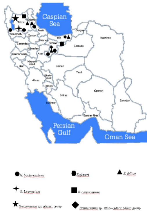
Figure 1. Map of Iran showing distribution of entomopathogenic nematodes complex

infected larvae transferred to a modified White trap. This resulted in isolation of S.glaseri , S.carpocapsae and H.bacteriophora . They used morphological and molecular data as well as cross breeding tests to identify them. Molecular analysis of ITS regions were most informative (Adams and Nguyen, 2002). Kary et al. (2009) reported occurrence of several EPNs in North Western at natural areas in Iran. They extracted and identified S. carpocapsae , S.feltiae , S.bicornutum and H.bacteriophora . These species were described by morphological and molecular characters. Nikdel et al. (2008) collected and introduced five EPNs from Arasbaran forests in North East Iran. The most commonly found species reported were S.carpocapsae and S.feltiae , H. bacteriophora was also isolated from different regions.