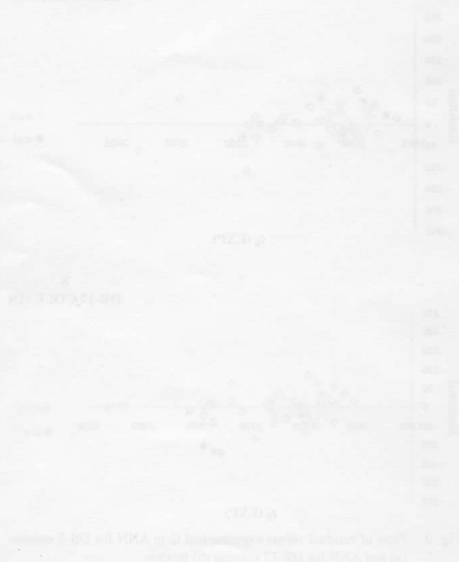
Fig. 1. The linear regression equations for ANNs for DB-1 column (a) and DB-2 column (b) for peak area (AU) versus retention time (min).