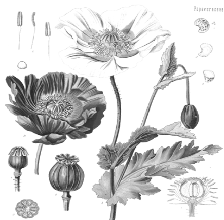
Fig. 1- Opium poppy, P. somniferum and different parts of its vegetative and generative organs [8]

Other alkaloids from poppy species have various uses: noscapine has antitussive and antitumorigenic properties; papaverine is a vasodilator and smooth muscle relaxant; sanguinarine is antimicrobial and anti-inflammatory [5, 7].