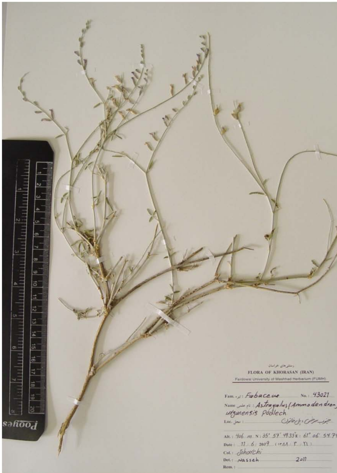
Fig. 2. Astragalus wrgunensis . –Joharchi 43021 (FUMH).