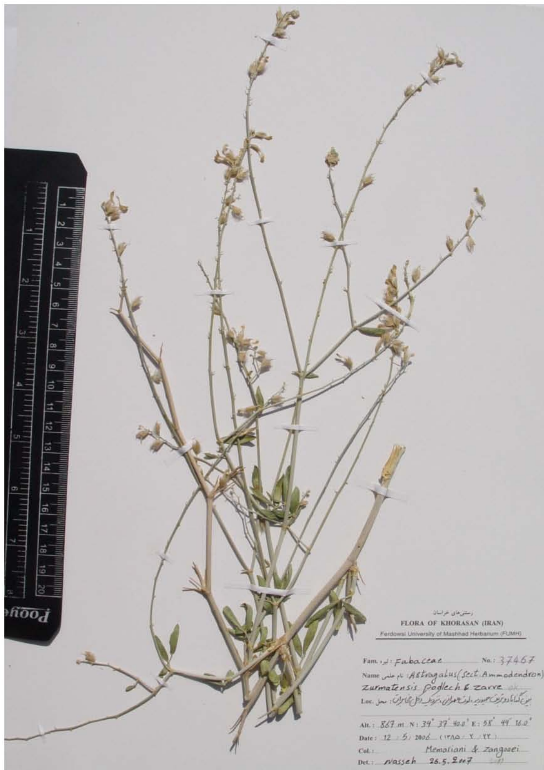
Fig. 3. Astragalus zurmatensis . –Memariani & Zangooei 37467 (FUMH).