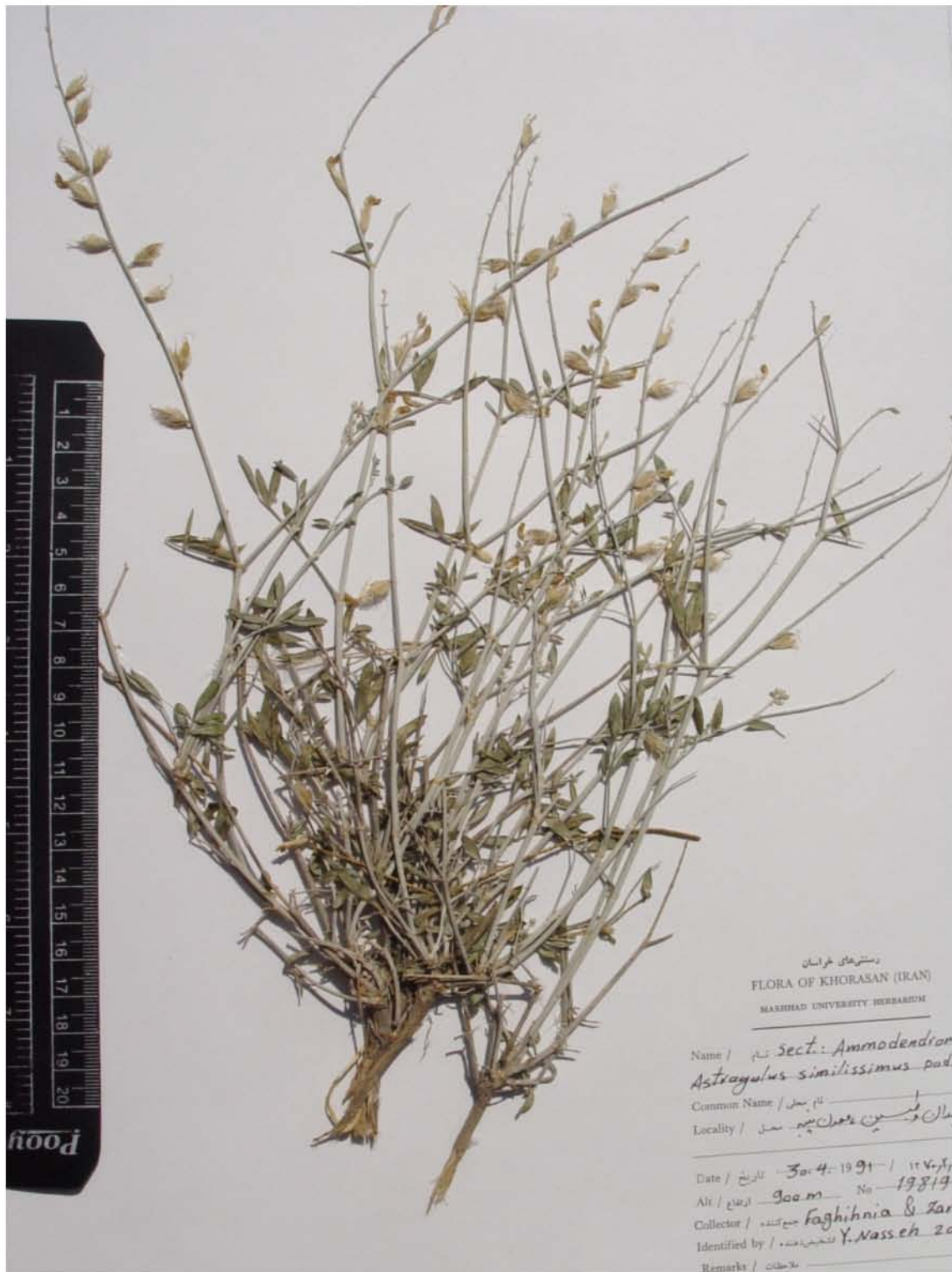
Fig. 4. Astragalus similissimus . –Faghihnia & Zangoeei 19819 (FUMH).