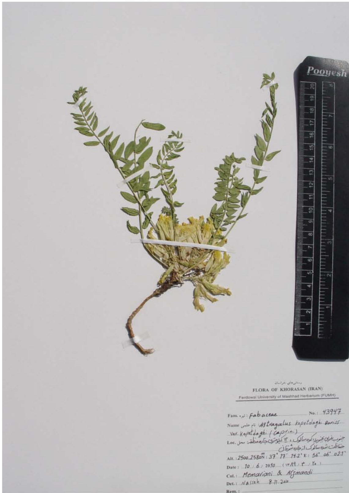
Fig. 6. Astragalus kopetdaghi var. kopetdaghi . – Memariani & Arjmandi 43947 (FUMH).