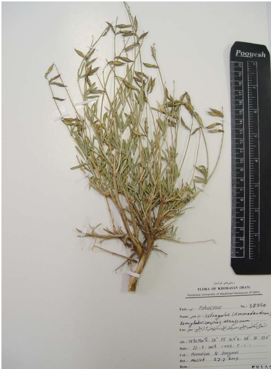
Fig. 5. Astragalus hekmat-safaviae . –Memariani & Zangoeei 38940 (FUMH).