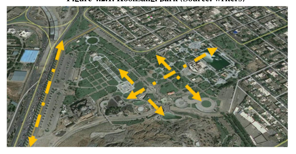
Figure 4.2.1. Koohsangi park