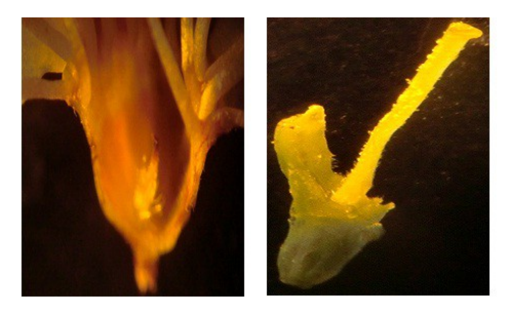
Figure 1. Comparison of damaged (left) and intact pistil (right) pistils treated with 0 and 200 mg. L-1 AA, respectively under artificial cold stress (-4 °C)