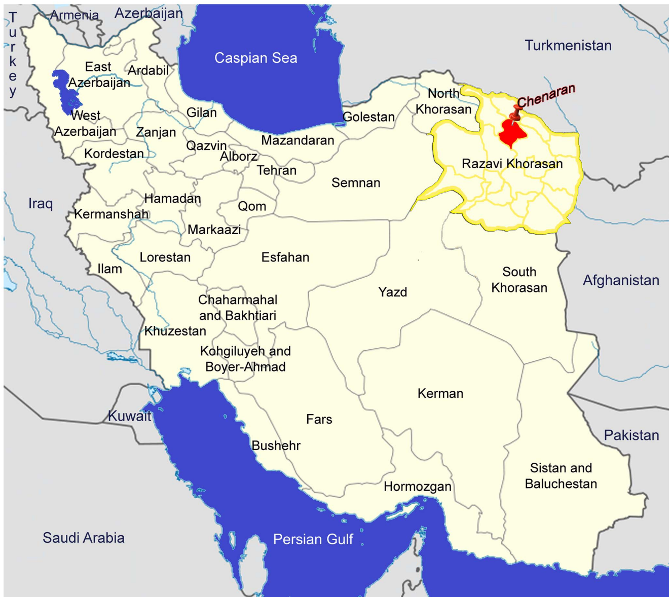
Figure 1. Map of Iran. Razavi Khorasan Province is highlighted by yellow border. The study area, Chenaran County, is indicated by red (red pin). Based on the map of Iran at [19]. doi:10.1371/journal.pntd.0002313.g001

were Crocidura gmelini (2.4%) of the non-rodent families Ochotonidae and Soricidae (Table 1).