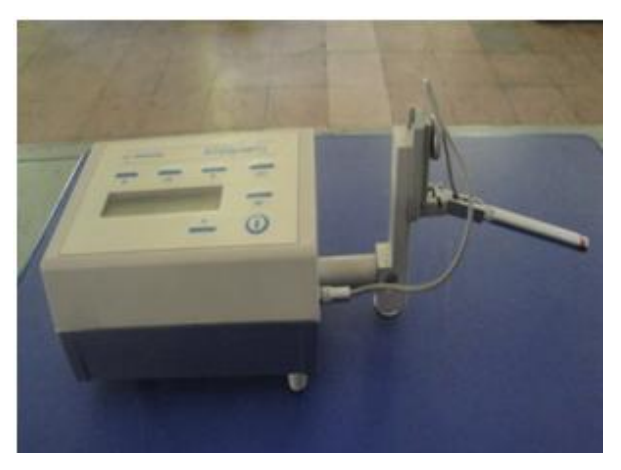
Fig. 3. Surface roughness tester used.