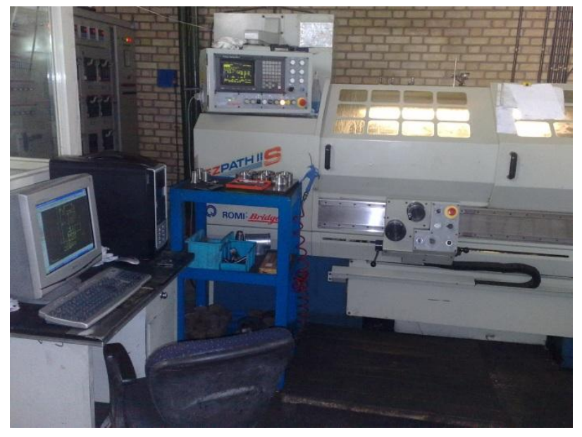
Fig. 2. CNC lathe machine used for experiments.

Cutting tests were carried out on CNC lathe machine under dry conditions. In total 8 work pieces are prepared. These work pieces were cleaned prior to the experiments by removing 0.5mm thickness of the top surface from each, in order to eliminate any surface defects and wobbling. Two different nose radii of CVD coated inserts have been taken to study the effect of tool geometry. The roughness of machined surfaces is measured by a Surtronic 3+ surface roughness tester (Fig. 3) and measurements are repeated 3 times. The experimental design and results are given in Table 2.