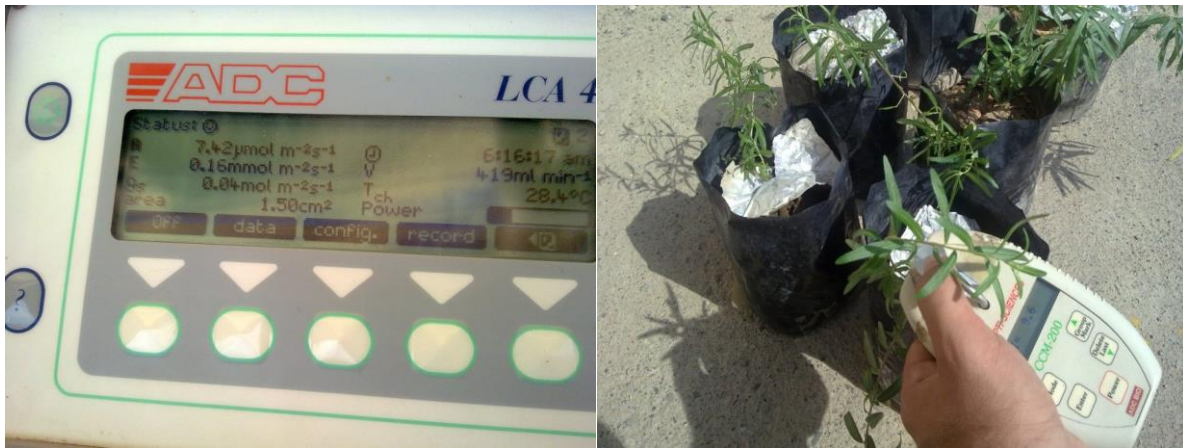
Fig. 1. Measurement of seedlings traits subjected to different devices.