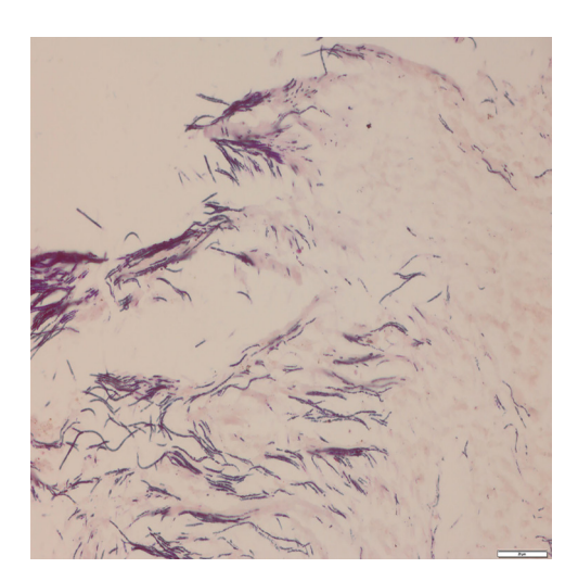
Lympho-plasmacytic proventriculitis associated with necrotic debris in the mucosal surface of the affected proventriculus. Hematoxylin and eosin, 200x.