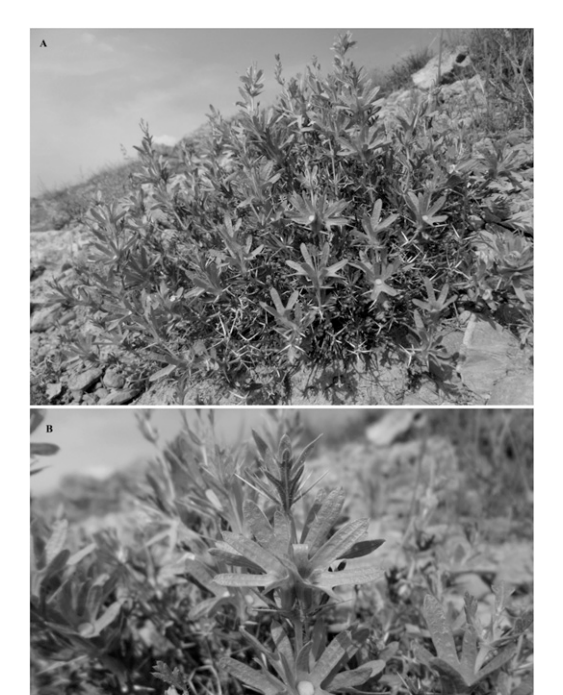
Figure 2. Lagochilus khorassanicus Zeraatkar, F. Ghahrem. & Joharchi. —A. Habit. —B. Close-up of flower. Photos by A. Zeraatkar from Mashhad–Kalat rd. (May 2016).

part of stem, obviously twice-trifurcated in verticillasters and near them, the middle branch strongly reduced and bracts superficially twice-bifurcated in lower part of stem; stalk (0-)1-1.7 mm, tomentose, glabrous at apex, covered with short, simple trichomes; basalmost part of stem without bracteoles. Calyx 20-30 mm, campanulate, at least 1.5(to 2.5) times as long as tube, 5-toothed or rarely 4-toothed; tube 6-10 \times 2-3 mm, sometimes bearing sparse 2- to 4(to 5)-jointed trichomes 40-50 \mu m; teeth narrowly oblong, unequal, 7-23 \times 1.8-2.5(-3) mm, apex acuminate or rarely subacute terminating in a prickle 0.5-1.2 mm; both surfaces covered with sessile capitate glands and short, simple trichomes on tube and nerves as well as at margin. Corolla ca. 22 mm, whitish, with distinct purple veins, cream to pale brown when dried; upper lip emarginate, with 2 equal teeth, densely covered with silky hairs abaxially, adaxially glabrous; lower lip trilobate, middle lobe notched, obcordate, lateral lobes linearlanceolate, abaxially sparsely pubescent, adaxially glabrous. Posterior stamens 15-18 mm, anterior 13-16 mm. Nutlets smooth, 3 \times 0.5 mm.