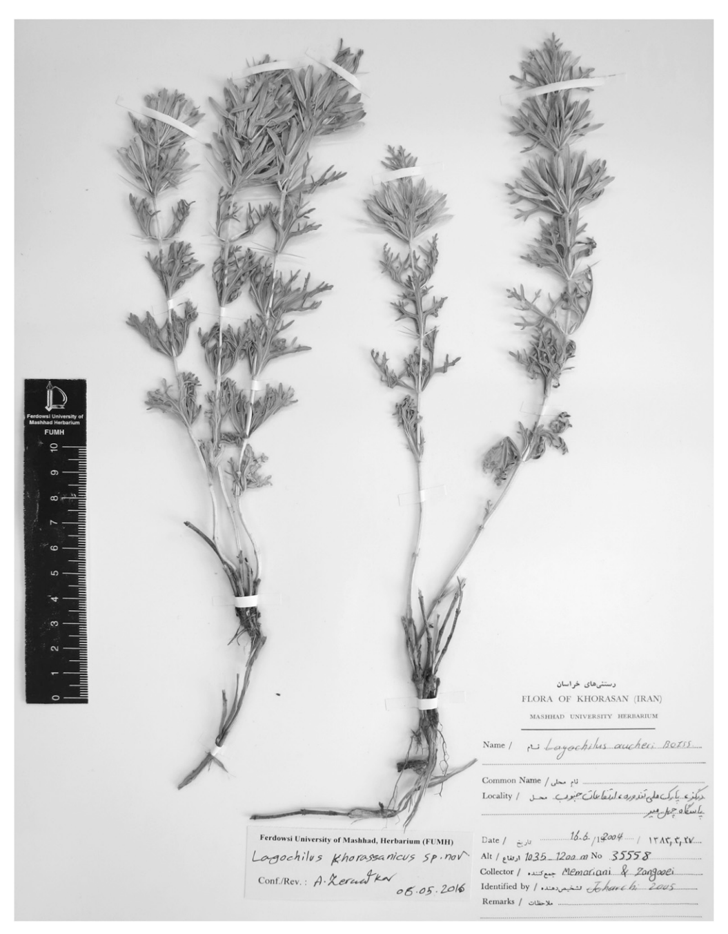
Figure 1. Holotype of Lagochilus khorassanicus Zeraatkar, F. Ghahrem. & Joharchi (F. Memariani & H. Zangooei 35558, FUMH).

leaf blade rhomboid, deeply dissected, 1- to 2-pinnate, often bipinnate, 18–32 \times 10–30 mm; segments linear-oblong with revolute margins, acuminate or rarely subacute, 1–8 \times 0.1–1 mm (to 2 mm wide in lowermost), apex of leaf segments of apicalmost leaves rarely short-spinescent with spine 0.25–0.5 mm; both surfaces