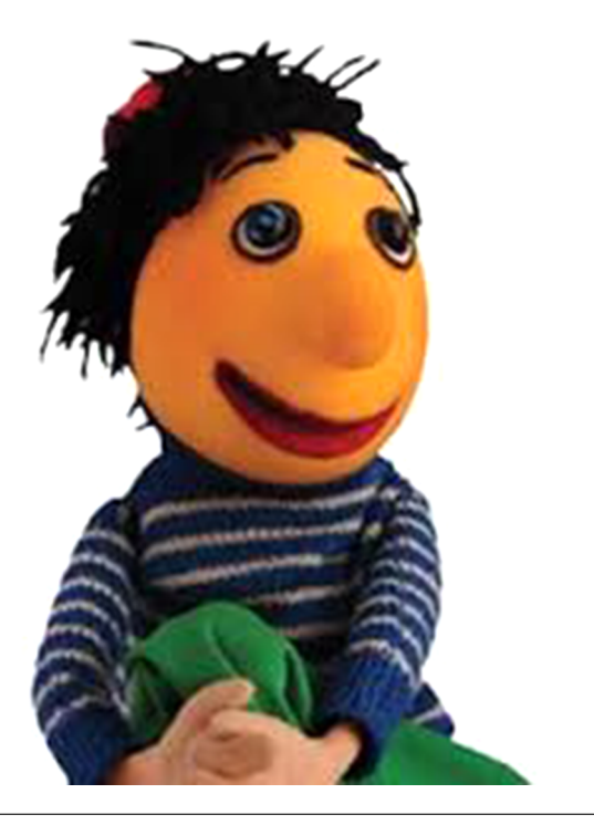
Figure 3. Red Hat Puppet

As a limitation of the current research, the individual differences of children (gender, age, etc.) could affect the anxiety score. It was tried to use randomization and control group to minimize these differences.