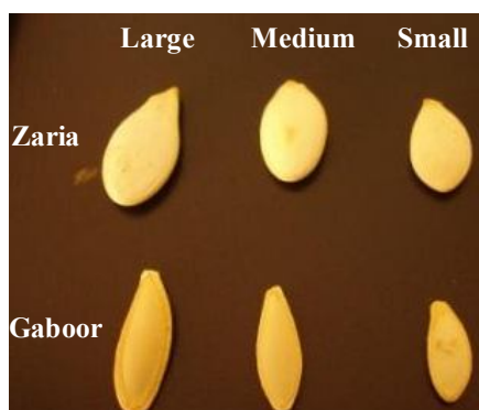
Fig 1. The size categories of two Iranian varieties of pumpkin seed.

The samples selected from two major commercial Iranian varieties of pumpkin seed namely Zaria and Gaboor . These cultivars were obtained randomly from different regions of Khorasan Razavi province, Iran, during autumn season in 2010 (Fig. 1). One hundred seeds of pumpkin were randomly selected from each variety so that twenty seeds were applied for each of five studied methods. The seeds were manually cleaned to remove all foreign matters such as dust, dirt, stones, immature and broken seeds. The initial moisture content of seeds were determined using the standard hot air oven method with a temperature setting of 105 \pm 1^\circ\text{C} for 24 h (Altuntas et al. , 2005; Coskun et al. , 2005, Khodabakhshian et al. , 2010). The initial moisture content of the seeds was found 7.8% and 7.2% d.b for Zaria and Gaboor , respectively. A Universal Testing Machine (Model H5KS, Tinius Olsen Company) equipped with a 5000 N compression load cell and integrator was used for the compression test of the pumpkin seed (Fig 2). Consequently, compression tests data were used with three elastic theories of contacting bodies: Hook , Hertz and Boussinesq theories.