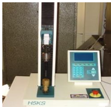
Fig 2. Universal test machine used in the compression test.