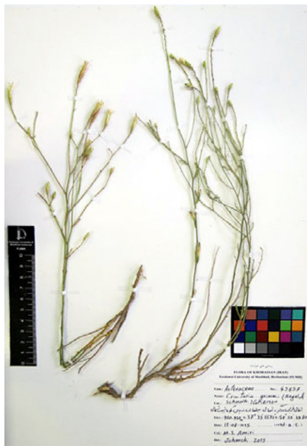
Fig. 2. Photograph of voucher herbarium specimen of Crinitaria grimmii .