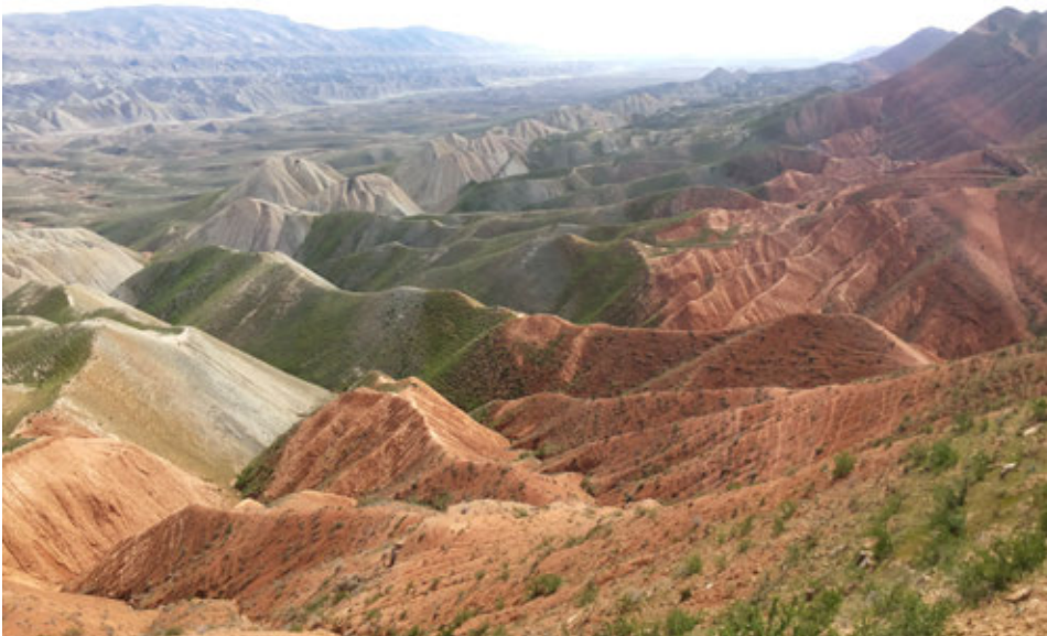
Fig. 4. Natural habitat of Crambe edentula and Crinitaria grimmii . They grow on red gypsiferous marl soils on the northern slopes of Zarrin-Kuh Protected Area (Central Kopet-Dagh, NE Iran).

This species was found in the same habitat as Crambe edentula but at lower altitude ranges (910–930 m), on the northern slopes of that protected area (Fig. 4). The following taxa exist abundantly in its locality: Acanthophyllum mucronatum C.A. Mey., Diarthron antoniniae (Pobed.) Kit Tan, Asparagus verticillatus L., Valeriana ficariifolia Boiss., Zygophyllum atriplicoides Fisch. & C.A. Mey., and Lolium subulatum (Banks & Sol.) Eig.