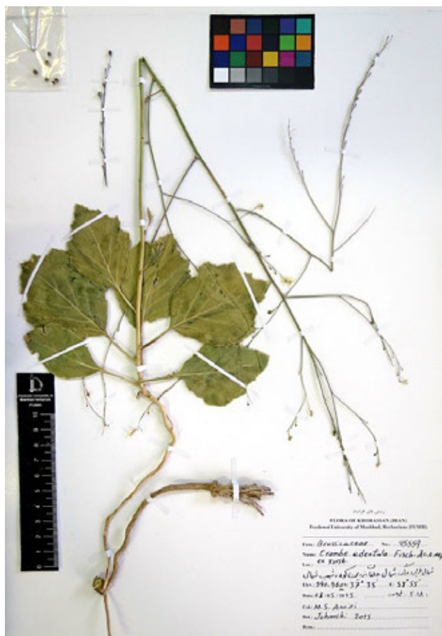
Fig. 1. Photograph of voucher herbarium specimen of Crambe edentula .

The genus Crambe L. ( Brassicaceae ) is an Old World genus with approximately 40 species worldwide. It is the only large (>10 species) monophyletic genus of the tribe Brassicaceae (Francisco-Ortega & al. 1999). This genus was categorized into three taxonomic sections, namely: Leptocrambe , Dendrocrambe and Crambe (Prina 2009). It is distributed between four major centers of species diversity. These major geographical regions include: Macaronesia, Mediterranean, East Africa, and Euro-siberia – Southwest Asia (Francisco-Ortega & al. 1999). The Macaronesian species are subsrubs and, as a rule, have small fruits with the pericarp adhering to the seed, whereas the Eastern species are hemicryptophytes, with