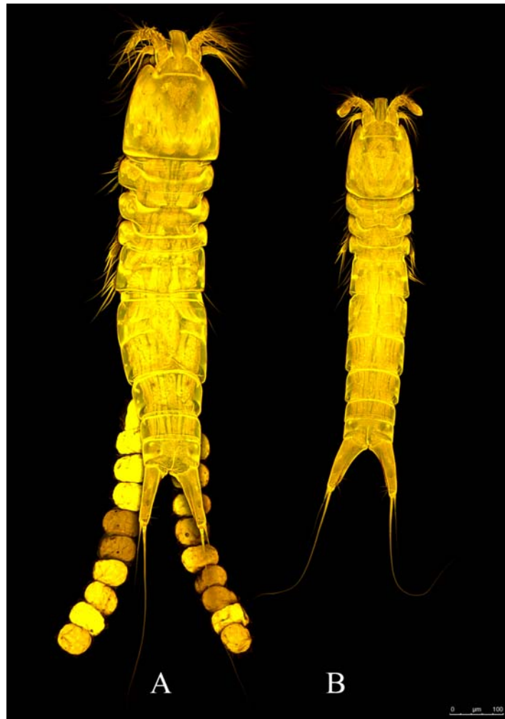
FIGURE 2. Canuellina insignis : Habitus, Dorsal (CLSM); (A) female; (B) male.

Distribution. C. insignis was recorded from the Red Sea, Suez Canal and Inhaca Island.