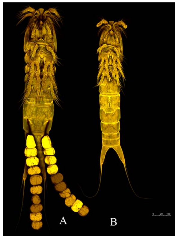
FIGURE 4. Canuellina insignis : Habitus, Ventral (CLSM); (A) female; (B) male.