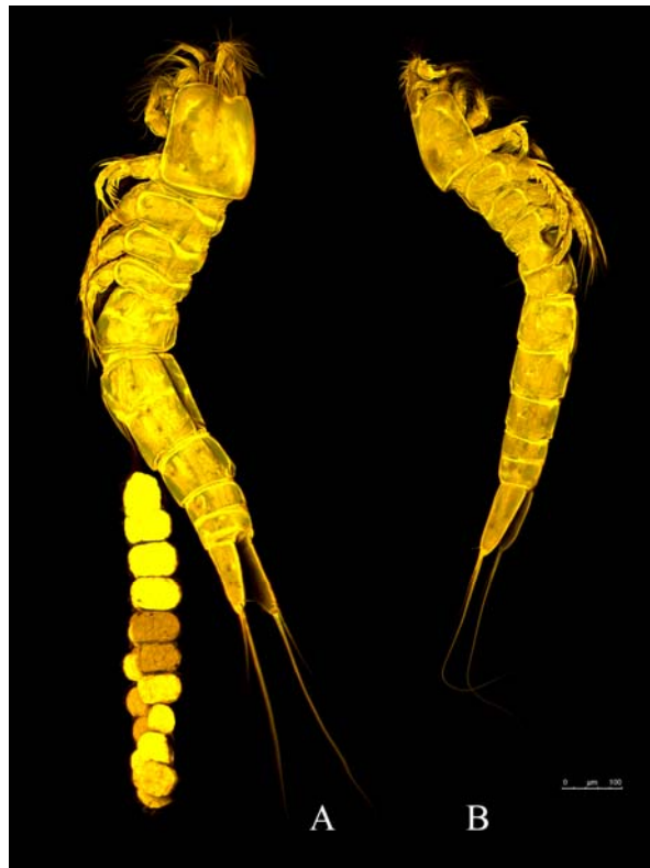
FIGURE 3. Canuellina insignis : Habitus, Lateral (CLSM); (A) female; (B) male.