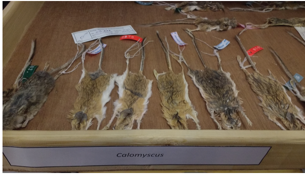
Figure 3: Darvish rodent collection at the Ferdowsi University of Mashhad.

A drawer containing skins of Iranian mouse-like hamsters ( Calomyscus ).