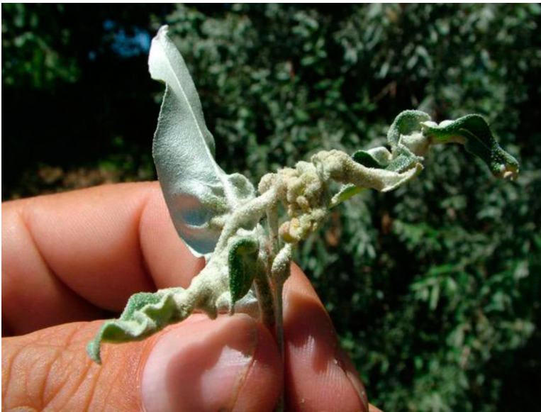
Figure 1. Symptoms of Aceria angustifoliae feeding on the shoots, flowers and fruits of Elaeagnus angustifolia .