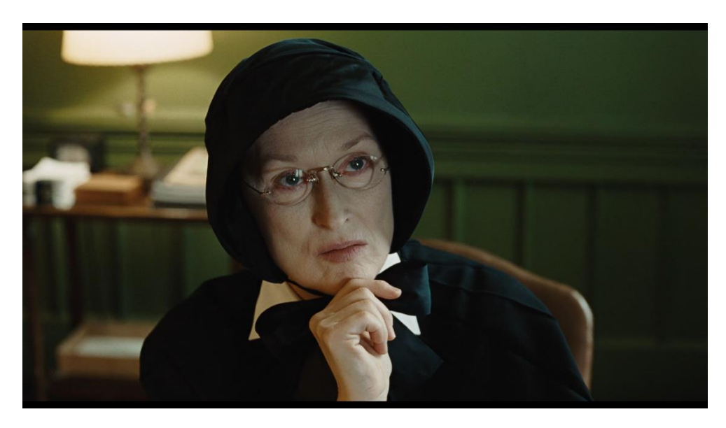
Figure 2. Sr. Aloysius' performance of turn 2 in the above exchange

Now, let us examine this exchange in the movie in order to analyze the kinesic aspects of their impolite behavior. Fr. Flynn has left the principal's chair to flip the blinds, and is standing up in front of the principal's chair next to Sr. James. Meanwhile, Sr. Aloysius, who had also left her chair to answer the phone, goes to the principal's chair, and sits down. As for turns 7 and 8 analyzed above, Shanley has decided to remove them from the screenplay; therefore, it is not possible to examine the performance of these two turns. Although, Sr. Aloysius' kinesic behavior of turn 2 is marked. The following figure shows her performance of this line: