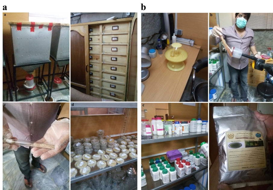
Fig. 2 Mass production facilities for parasitoids and microbial agent as biocontrol agents in Afghanistan

Before 2009, there were no legal instruments for pesticide companies to regulate their product registration, import, distribution, and application in Afghanistan. The