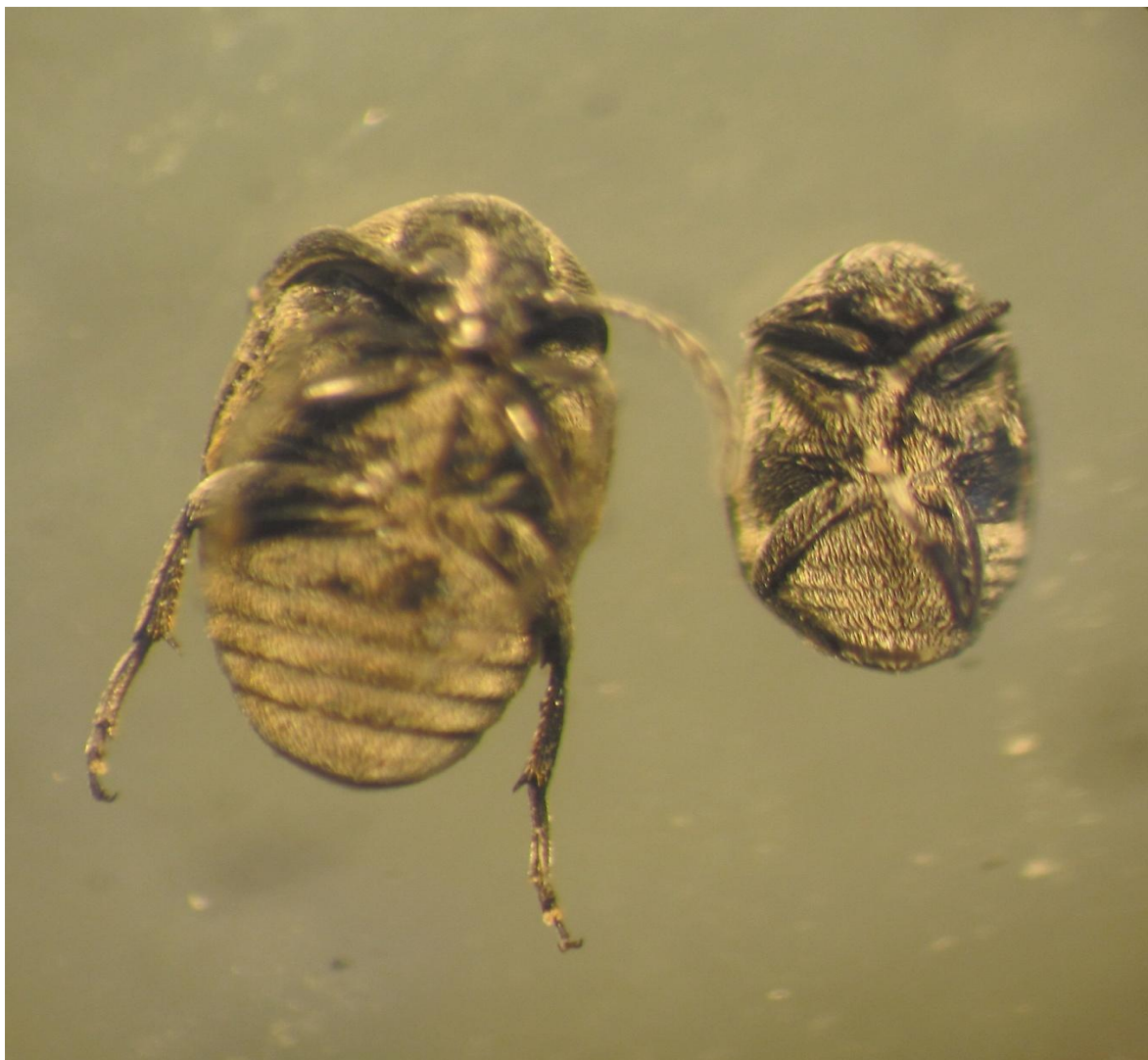
Figure 1- Male (right) and female (left) adult specimen of S. sericeus .