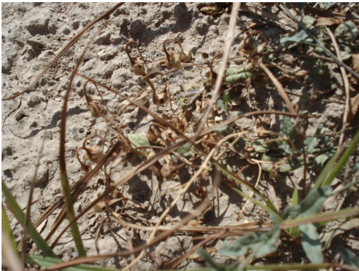
Figure 4- Sever damage of S. sericeus on reproductive parts of field bindweed.