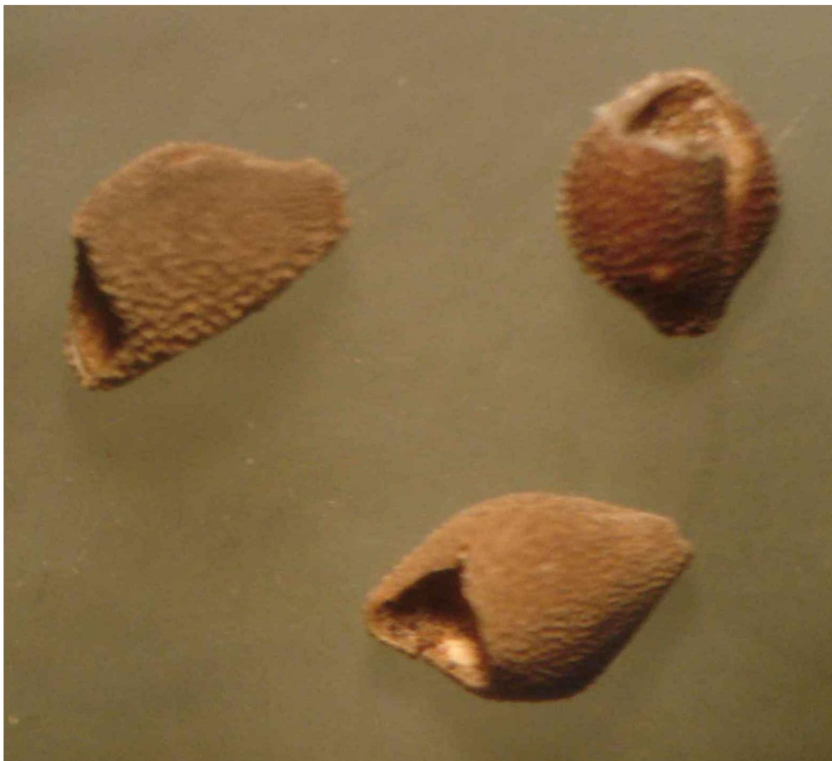
Figure 3- The perforated seeds by S. sericeus .