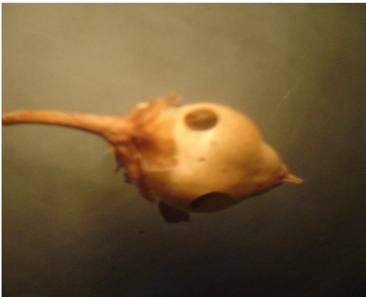
Figure 2- Destroyed field bindweed capsule by S. sericeus .