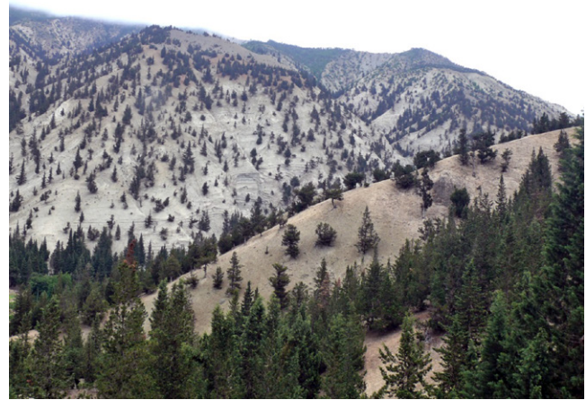
Fig. 2. Cupressus sempervirens stands in Hassanabad, Chalous valley.

In the east of Gilan province, in the Eshkevar valley, the cypresses are again observed in the rocky outcrops and steep slopes of the valleys and on both sides of the Polerud river. But in this habitat (No. 4) no trace of Mediterranean species can be seen and cypress is