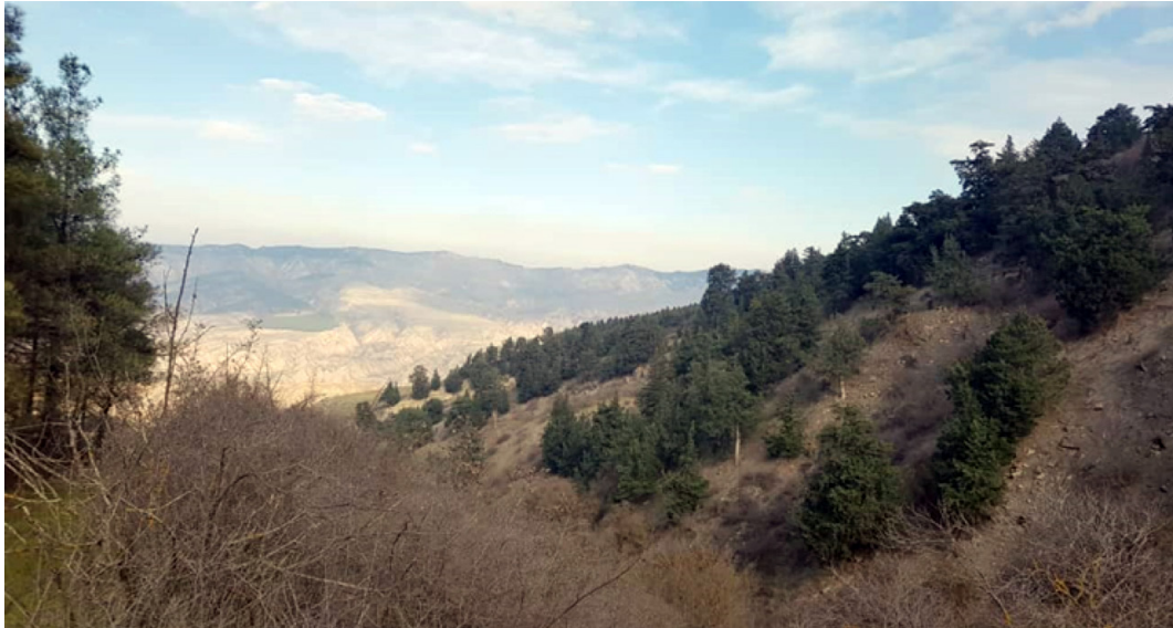
Fig. 5. Residual forest of Cupressus sempervirens in Qezel otagh habitat.