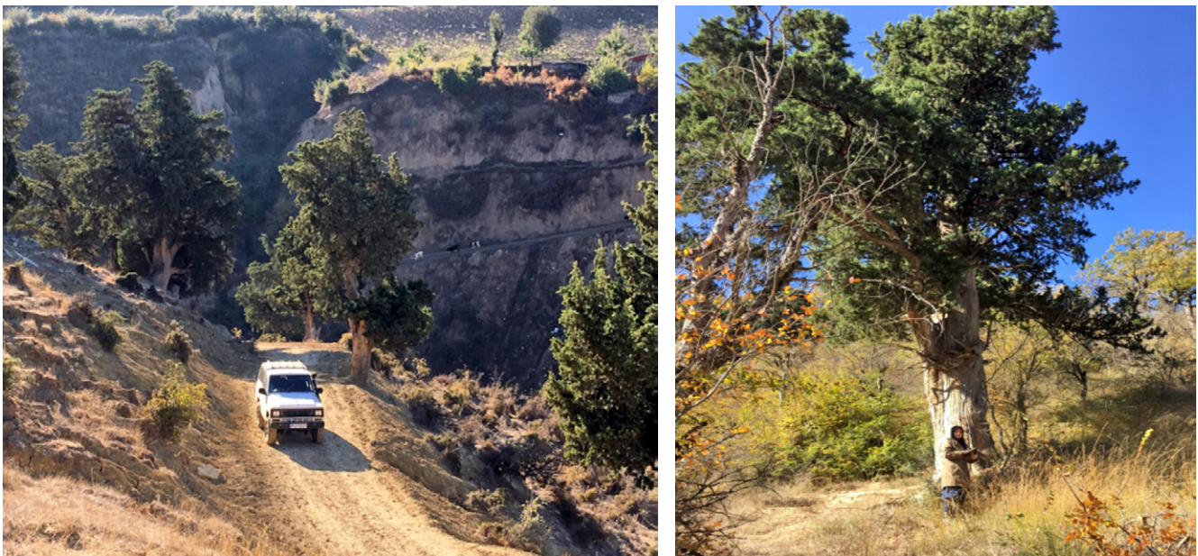
Fig. 4. The old trees and sites of Cupressus sempervirens L. in Sarve Bala, Easternmost of Golestan province (Left). Dispersed Cypress trees in the Oak forests of Golestan National Park. As shown in the figure, trees with a trunk diameter above 120 cm are abundant (Right).

detailed studies on its habitats, no proper conservation management has been applied to them so far. A detailed review has been done in Hyrcanian habitats of Mediterranean cypress during the project entitled “An ecological, floristic and dendrochronological study of Cupressus sempervirens L. stands in the South Caspian (Hyrcanian) region: implications for conservation”, the study area includes Golestan,