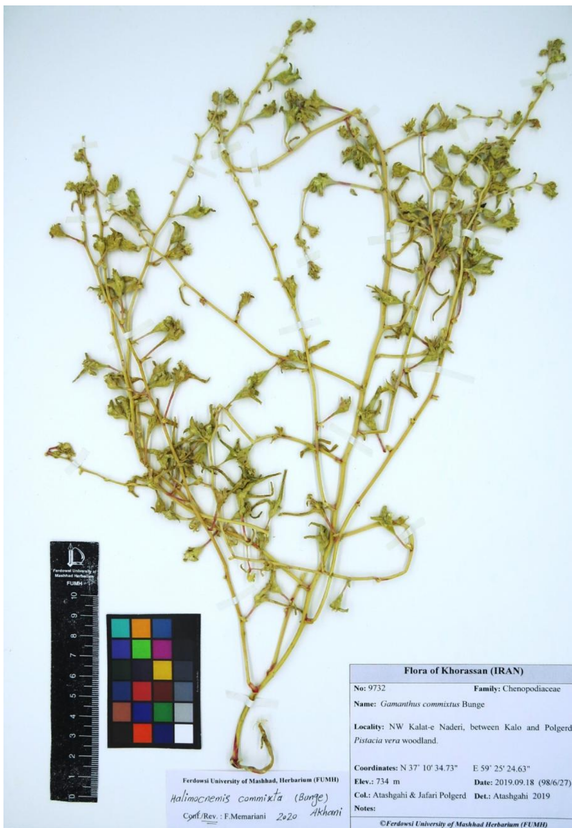
Figure 1. Herbarium specimen of Halimocnemis commixta (Atashgahi & Jafari Polgerd 9732-FUMH).