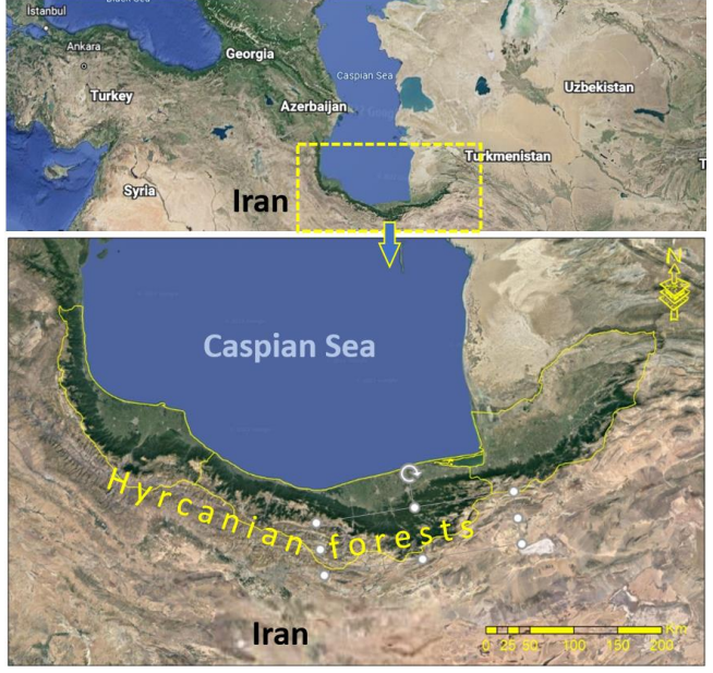
Figure 2. The Hyrcanian Forests in Iran

The Hyrcanian Forests World Heritage property stretch 850 km along the southern coast of the Caspian Sea and covers around 7% of remnant Hyrcanian forests in Iran (Figure 2). These ancient forests are important refugia and the world's only remaining temperate deciduous broadleaved forests Ramezani et al., 2008).