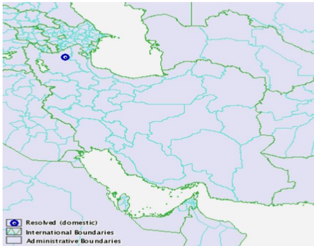
Fig. 1. The location of outbreaks in Iran

samples. The thermo-cycler protocol of reaction was Initial denaturation 95 °C for 3 minutes, followed by 35 cycles (denaturation 95 °C for 30 seconds, Connection 52 °C for 30 seconds, expansion 68 °C for 30 seconds) and a final extension step at 68 °C for 10 minutes.