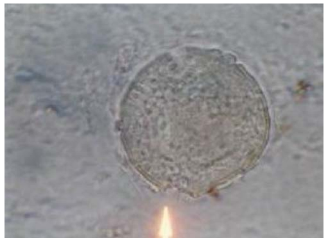
Fig. 2 IHC identification of tissue cyst of Neospora caninum with numerous bradyzoite enclosed in a thick cyst wall (arrow) in the brain of an aborted bovine fetus, ×1,000

ogy (Sager et al. 2001). This method has become important in the diagnosis of N. caninum abortion in cattle, when PCR results can be associated to histopathology finding in aborted fetal tissues. By using PCR, N. caninum DNA was detected in 13% (13) of brain samples. In association to a previous report in Iran (Habibi et al. 2005), it seems that the prevalence of N. caninum DNA infection is high in the brains of bovine aborted fetuses. Histopathologically, the characteristic lesions of Neospora infection, such as non-suppurative necrotic (Barr et al. 1990; Dubey and Lindsay 1993; Dubey et al. 1998; Morales et al. 2001; Wouda et al. 1997) were observed in 12 (22%) out of 53 brain samples. N. caninum DNA was detected in seven (58%) of 12 cases with cerebral necrotic lesions by PCR that provided a solid evidence for N. caninum to be the cause of abortion. But in five (41%) out of 12 cases, we found cerebral necrotic lesions without detectable N. caninum DNA. Due to the