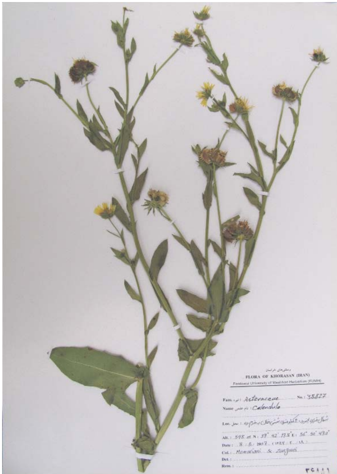
Fig. 1. Calendula karakalensis .