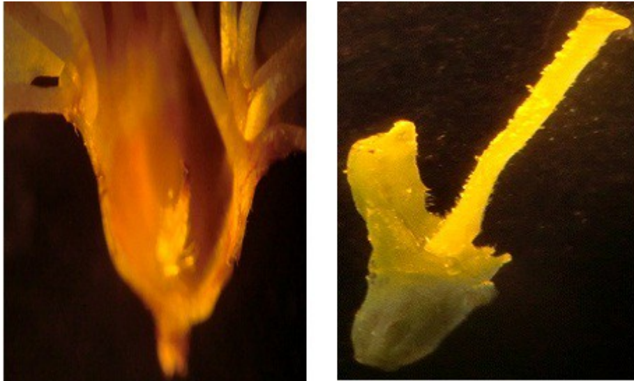
Figure 1. Comparison of damaged (left) and intact pistil (right) pistils treated with 0 and 200 mg. L -1 AA, respectively under artificial cold stress (-4 °C)