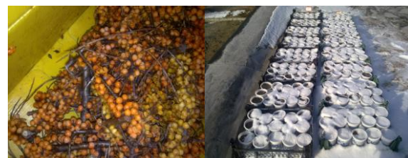
Fig. 1. Sea buckthorn berry (Left), seeds in pots in winter season

Comparisons of results SNK mean separation at 5% level replication, irrigation, soil and pretreated are as follows: 1) Grouping all iterations for all parameters in group A was the one, 2) Grouping for irrigation: a group for all indices except days to germination index was in the 2 group, 3) Grouping soils: all were classified in four groups except germination energy and germination values were in the 3 groups and 4) Grouping in Pretreatments: in Table 5 it is indicated that some groups have similarities.