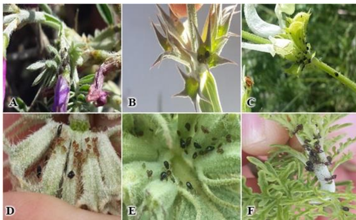
Figure 1. Brachycaudus cerasicola (Mordvilko, 1929) colonies on different parts of their host plants. A. & B. on Stachys ; C. on Salvia ; D. & E. on Phlomis ; F. on Perovskia .

Abbreviations used in the text are as follows: ANT, antennae length; ANTI, ANTII, ANTIII, ANTIV, ANTV, ANTVIb, antennal segments I, II, III, IV, V, and the base of antennal segment VI, respectively; ANTIII Base, basal diameter of antennal segment III; PT, processus terminalis; Rhin, Rhinaria; URS, ultimate rostral segment; 2HT, second segment of hind tarsus; and SIPH, siphunculus.